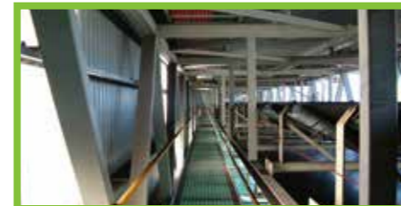
Anti-Slip Aluminium Net